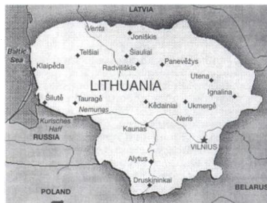
Fig. 1. Map of Lithuania

The gross national product (GNP) is US$310 per capita, almost 19 times less than the GNP of the US and 14 times less than that of the UK. Poor economic prospects, high rates of unemployment, corruption of some bankers, businessmen and government officials, and the disillusionment of large numbers of the population who hoped for democracy without knowing precisely all the implications of an abrupt move from a communist system into a free economy have all produced general despair and public insecurity. In this context, according to the psychiatrists I met in Lithuania, there is an increase in the rate of delusions related to buying and selling and economic activities along with the development of the market economy in Lithuania. Even though official statistics are not yet available, the rate of depression is increasing in an unprecedented manner, along with an increasing rate of unemployment. At the same time, the number of socially neglected patients with